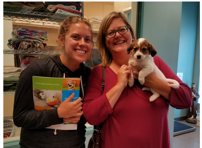
One of Lucy's puppies being adopted!

For more information about Benton County Canine Shelter or to pick up a newsletter, contact us at: