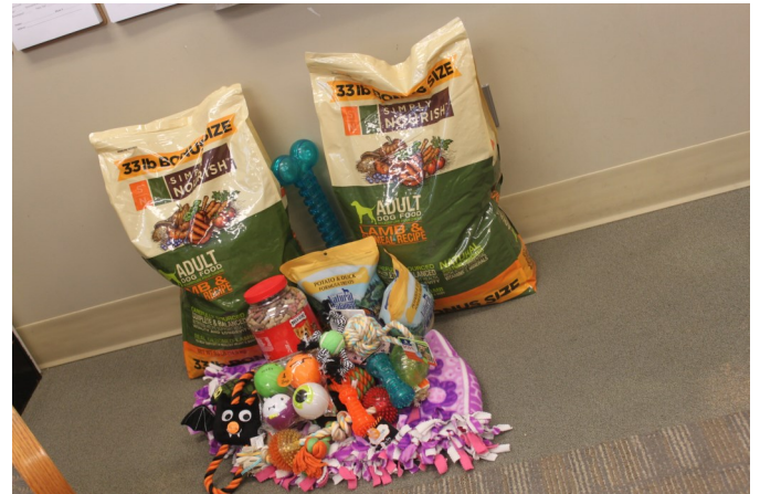
Above: Food and toy donations

Since all of our food is donated to us each quarter we go through our dog food that is close to expiring. We know we will not be able to use all of it so we donate it to Prevent Homeless Pets. In August we were able to donate 500 pounds of dry dog food.