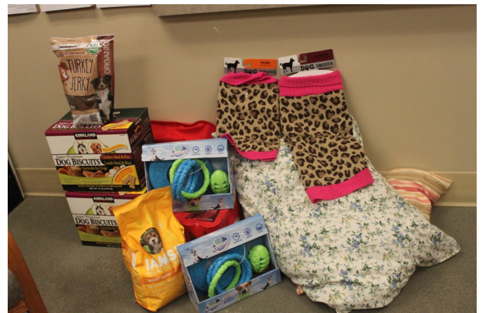
Below: Food, toys, and sweaters donated for our dogs

THANK YOU TO THE FOLLOWING ORGANIZATIONS, YOUR SUPPORT AND HELP IS GREATLY APPRECIATED!