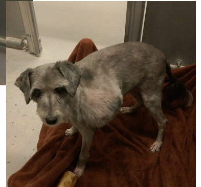
Anakin and Sparky were both transferred to Kindred Souls hospice after being diagnosed with terminal cancer.